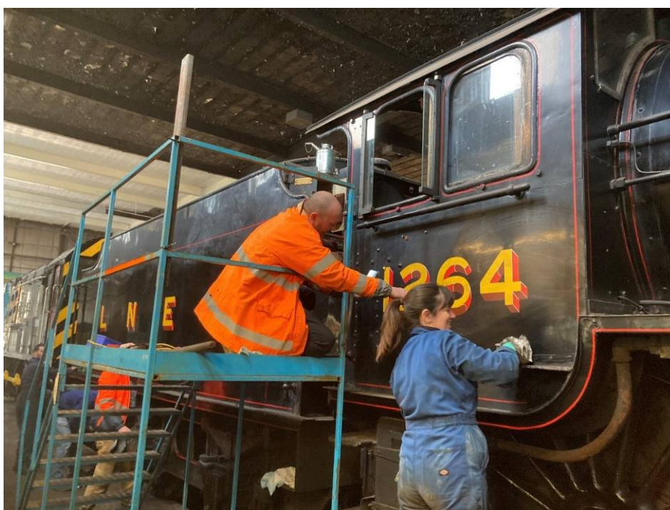
Cleaners hard at work on 9 th March.

A dozen or more people turned up to clean the loco on Saturday 9th March, in advance of the GCR 125th Anniversary weekend on 16th/17th March. Having gone uncleaned for the best part of 4 years, she was made to look a whole lot more presentable. With a few noble exceptions, it was all new faces – very encouraging to see. Let us hope that it signals the dawn of a new era for the loco, with a new generation of enthusiastic followers keen to get involved.