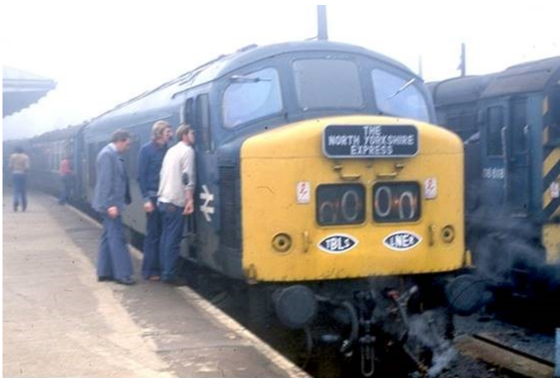
On a foggy 15th October 1977 'Peak' 45042 stands at the head of the Thompson B1 Locomotive Society's 'North Yorkshire Express'.