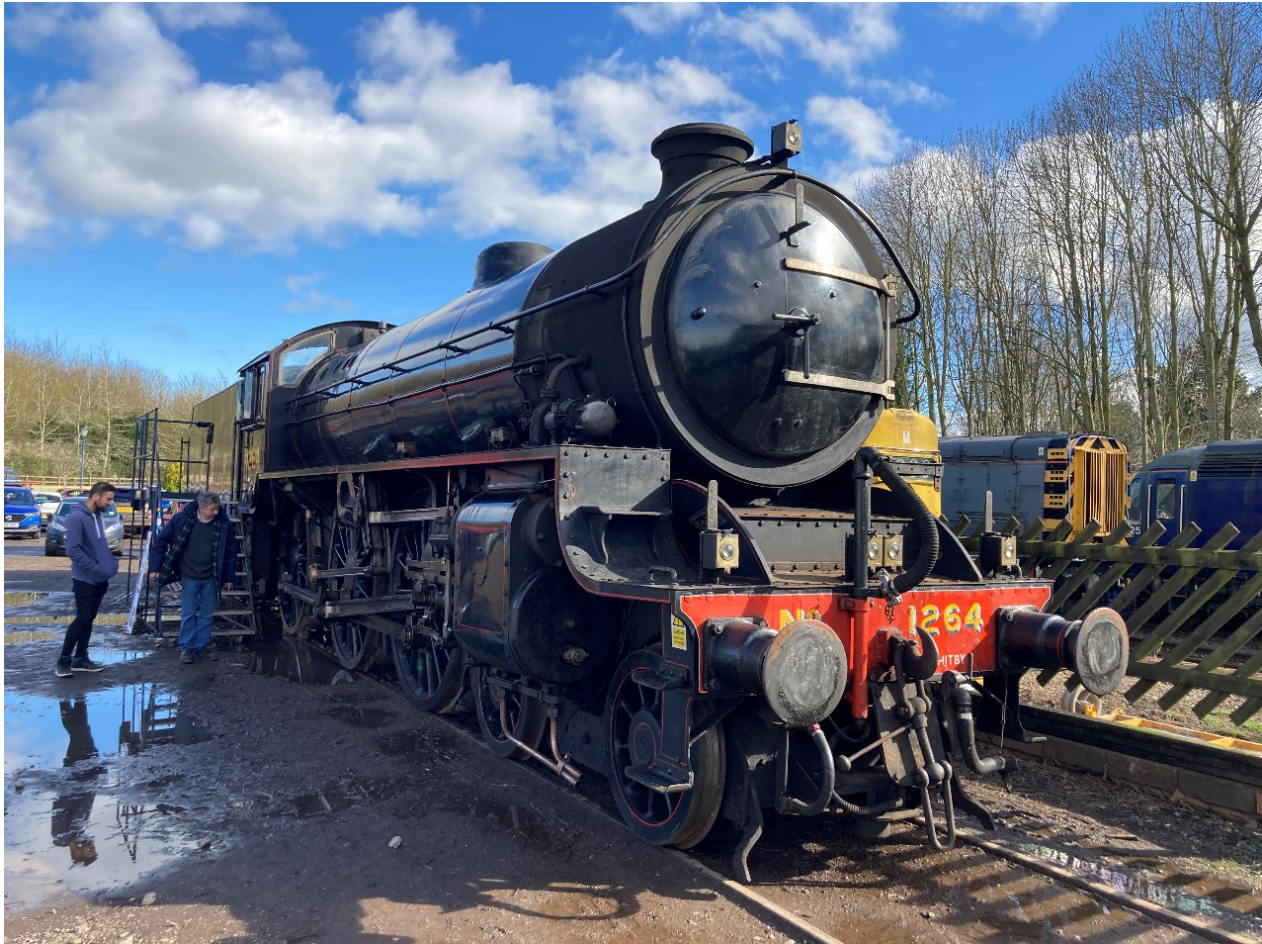
The loco on display at Ruddington during the 125 th anniversary weekend.

David Lewis, one of our members and volunteers on the stand, again graced us with his superb 5" gauge model B1 no. 61003 'Gazelle' on display (complete with miniature Thompson B1 Locomotive Trust headboard). The model loco also gave rides round the NSMEE club track on Sunday.