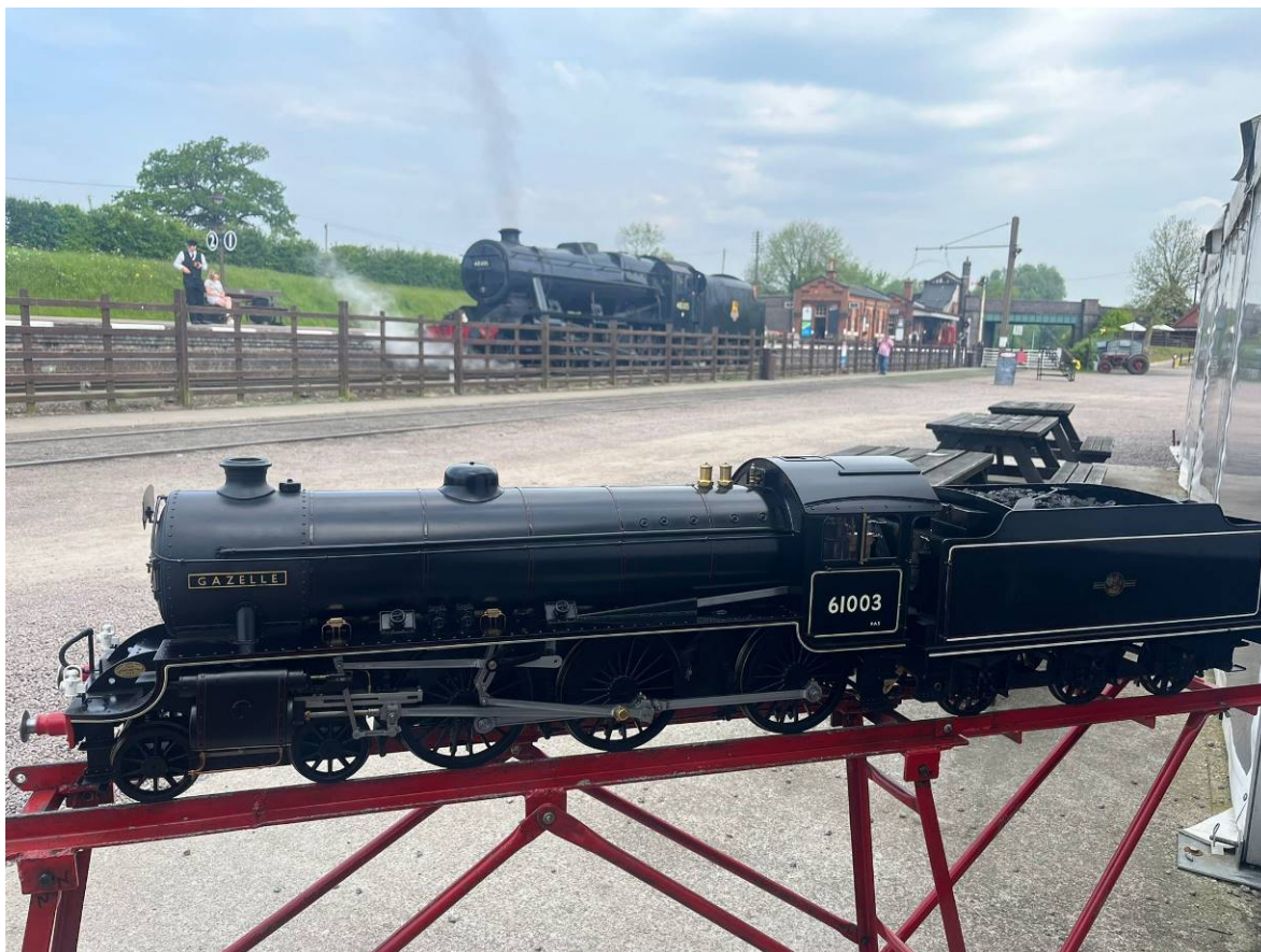
The 5" Gauge model of Gazelle with full sized 8F No 48305 in the background.