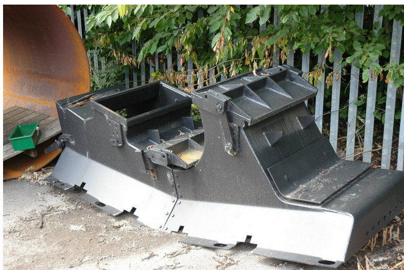
The new ashpan was fabricated by Hill & Webster in Ashbourne and was delivered earlier this year to Crewe.