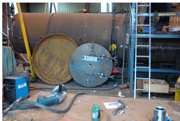
The new smokebox awaits the fitment of the door ring (left). The new smokebox door is complete (right).